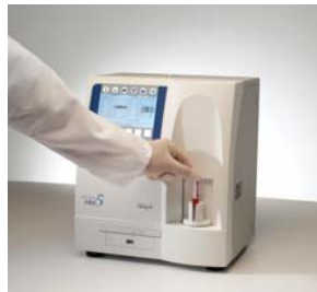
insert sample and press start